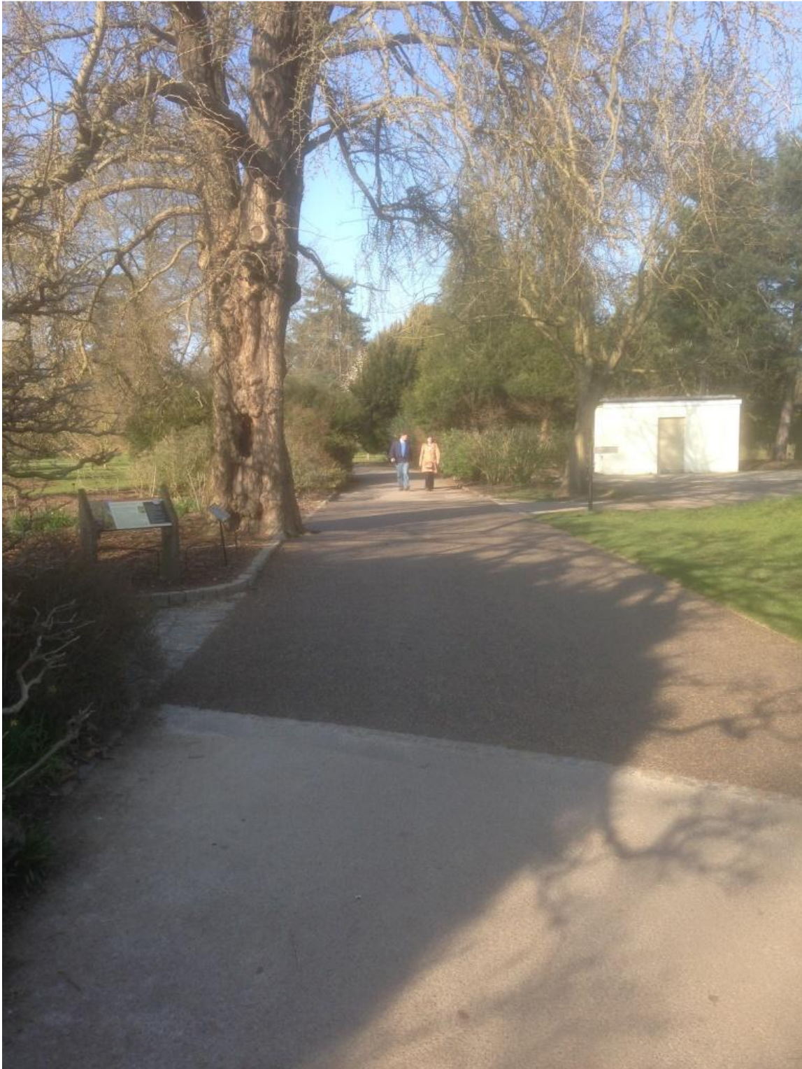
Photo 11 -Resin Bonded Gravel used across a root-plate of the TROBI Champion Ginkgo at Kew Gardens (London)